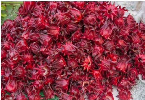
Figure 1: Rosella ( H. sabdariffa ) flowers .