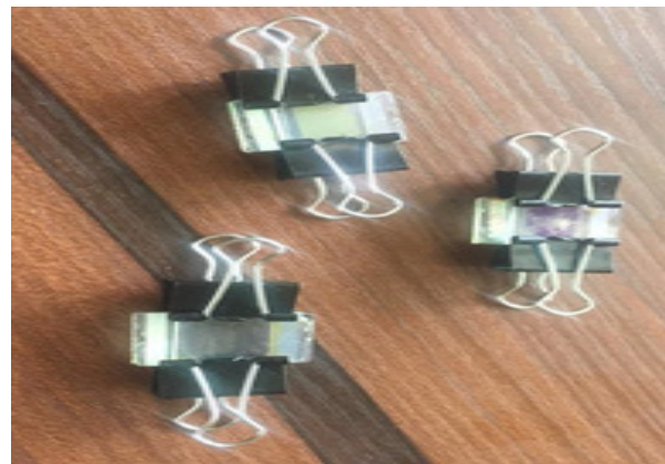
Figure 2: Assembled dye-sensitized solar cells showing the electrodes being held together with binder clips.

The fabrication of DSSCs normally involves using materials with properties that typically increase the performance and efficiency of the cells. This includes a porous film of nanocrystalline semiconductor such as titanium dioxide film, an electrolyte, dye sensitizers, and conductive glasses as electrodes.