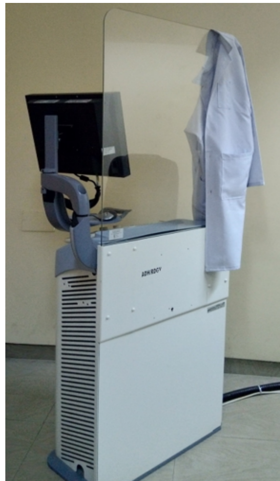
Figure 1. GE Senograph Essential Digital Mammography Unit.

The image quality was evaluated using European guideline